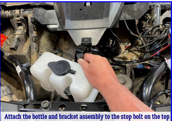
Attach the bottle and bracket assembly to the stop bolt on the top and the round bar on the bottom using the ruber coated strap.